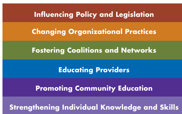
SPECTRUM OF PREVENTION

Yet there are still major challenges in mainstreaming this approach. Even with recent changes in thinking, informants repeatedly emphasized that there remains a strong reliance on healthcare as the solution to health problems—and a primary focus on education and individual responsibility as the path to healthy behavior. Indeed, in recent years community-wide prevention and public health strategies are increasingly cast as the intrusions of a “nanny state.” Ultimately, improving the practices of major societal institutions will be needed in order to change community environments in ways that improve health and there remains more to be done for this approach to truly take root: “What we found is a real necessity for clarity [about] what public health policy and advocacy actually is and successful ways to embark upon it.”